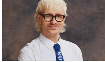
The Netherlands Joost Klein - Europapa